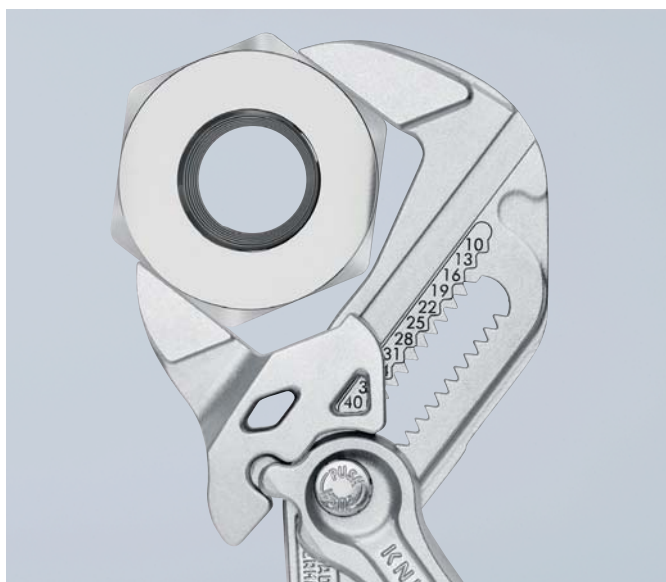
Opening width lasered onto the pliers head (metric on the front and imperial on the back)