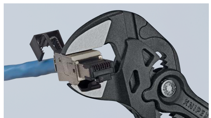
Work without damaging sensitive surfaces